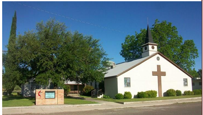
First UMC – McCamey